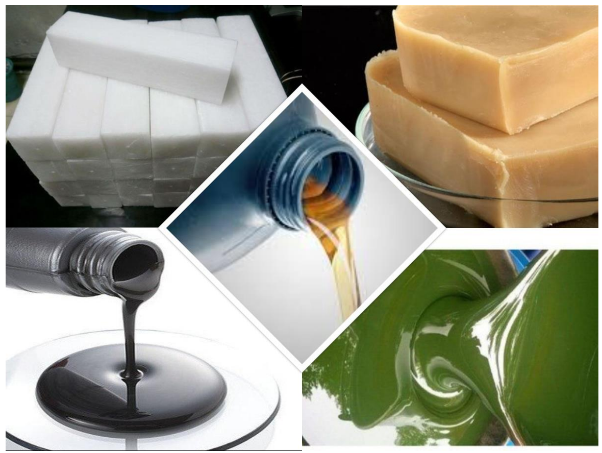
Petroleum and petrochemical Products

We deliver and supply products, chemicals and Petrochemicals such as: LPG, Methanol, Paraffin, Wax, Slack Wax, Residue Wax, Rubber Processing Oil, Recycle Base Oil, Base Oil with various SN, Spindle Oil, Motor Oil, Bitumen, White Oil, Furnace Oil, Paraffin Oil, Diesel, Kerosene, Micronize Sulphur Powder & Epoxy PVC Resin.